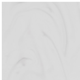
Dolphin Slate Tier 1