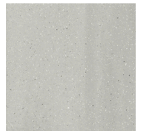
Dolphin Urban Ash Tier 2