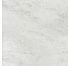
Dolphin Pristine Tier 1