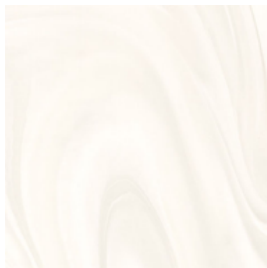
Dolphin Opal Tier 1