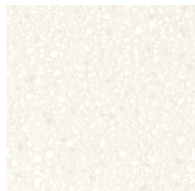
Dolphin Frost Tier 2